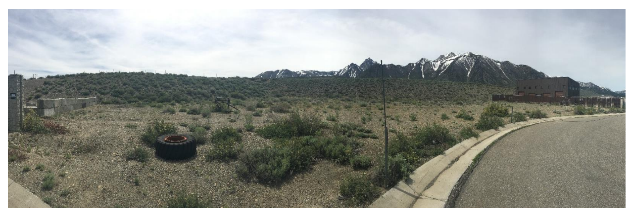
FIGURE 6: PROJECT SITE PICTURE #3

View of the project site, adjacent parcels, and surrounding landscape looking southeast.