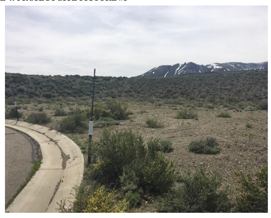
View of the project site and the Perimeter Maintenance Zone (PMZ) located on the south & east sides of the parcel.