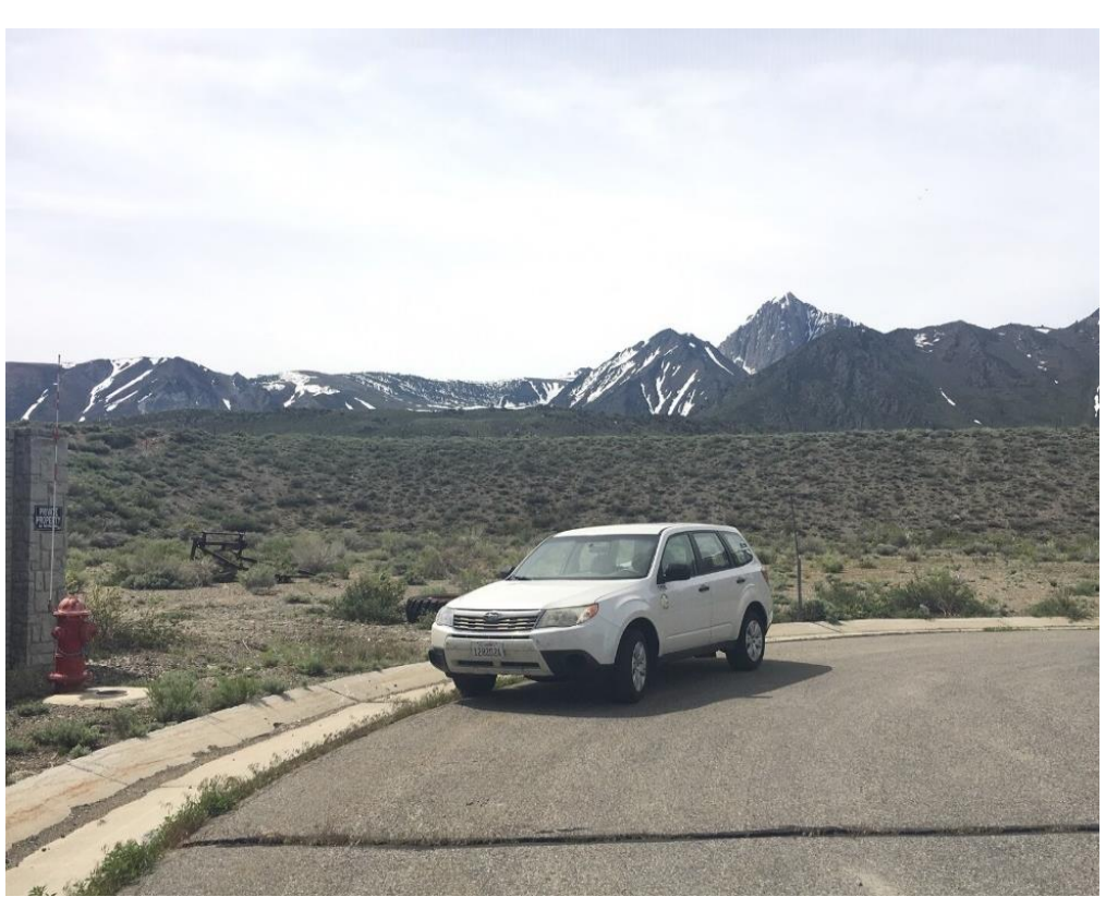
View of the project site looking south.