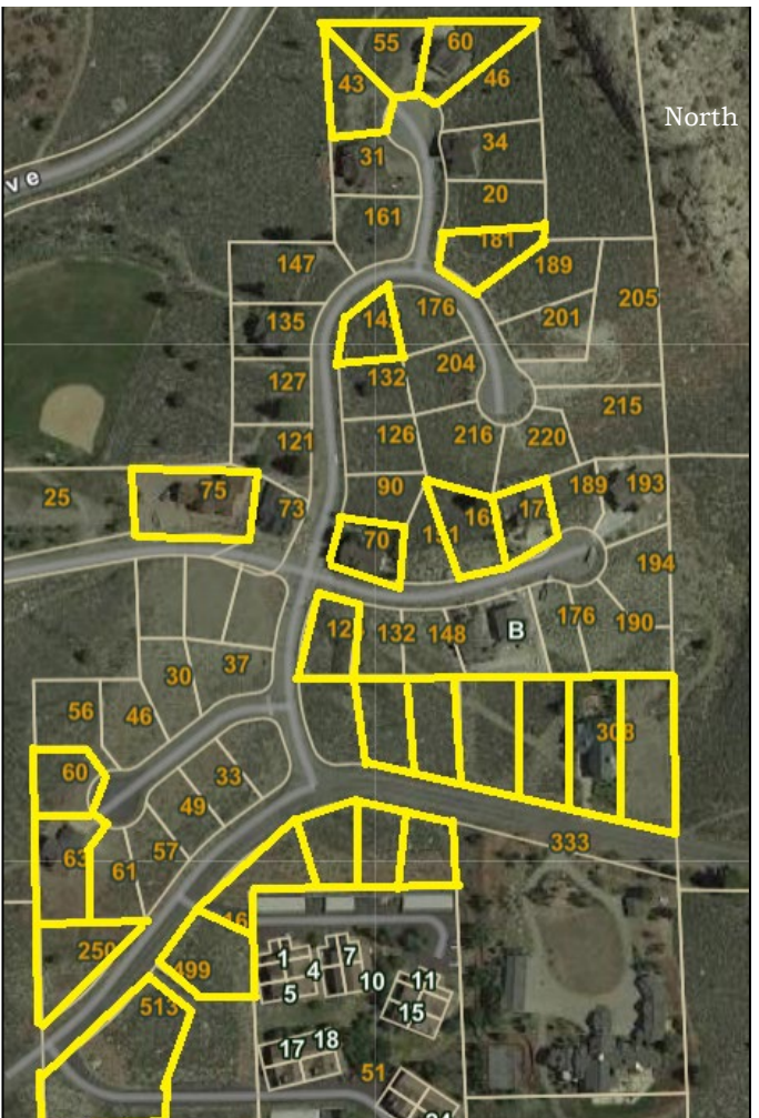
Figure 2. Properties in Specific Plan Amendment #2.

In March 2001, the Mono County Board of Supervisors adopted Resolution R01-26, certifying the June Lake Highlands Specific Plan, Final EIR, and Tentative Tract Map (#34-24, Phase I) allowing development of 39 single-family residential lots and 114 condominium units on 21.2 acres. The June Lake Highlands Specific Plan contains land use goals, policies and standards for development of the property. The Specific Plan approval includes 35 conditions, however transient rentals (rentals less than 30 days) were not addressed.