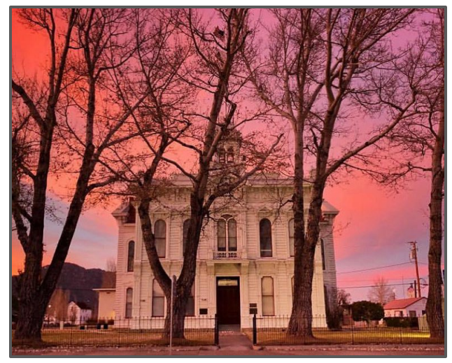
Bridgeport Courthouse

Mono County has several small towns and charming villages, each with its own scenic beauty, year-round recreational opportunities, natural historical and attractions, and unique characteristics. The County seat is proudly located in Bridgeport, where the original 1881 courthouse is the second oldest in the state to be in continuous use. The only incorporated town in the county is Mammoth Lakes, which is located at the base of world-renowned Mammoth Mountain Ski Area, with a summit of 11,053 feet, over 3500 skiable acres, 28 lifts, and an average of 400 inches of snowfall annually. January 2017