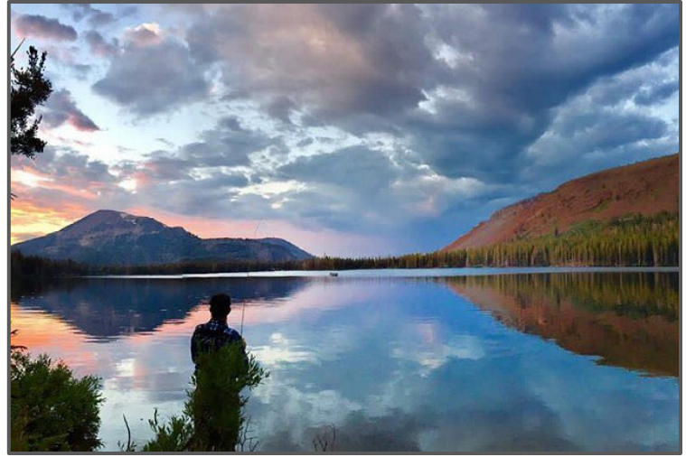
Lake Mary

cycling, horseback riding, golfing, and endless warm-weather adventures. Photographers flock to the county in September and October when it is almost impossible to take a bad photo of the fall color that lights up the Eastern Sierra landscape. Sunset Magazine named Mono County one of the "Top 5 places to Hike" in autumn and TravelAndLeisure.com listed Mono County as one of "America's Best Fall Color Drives."