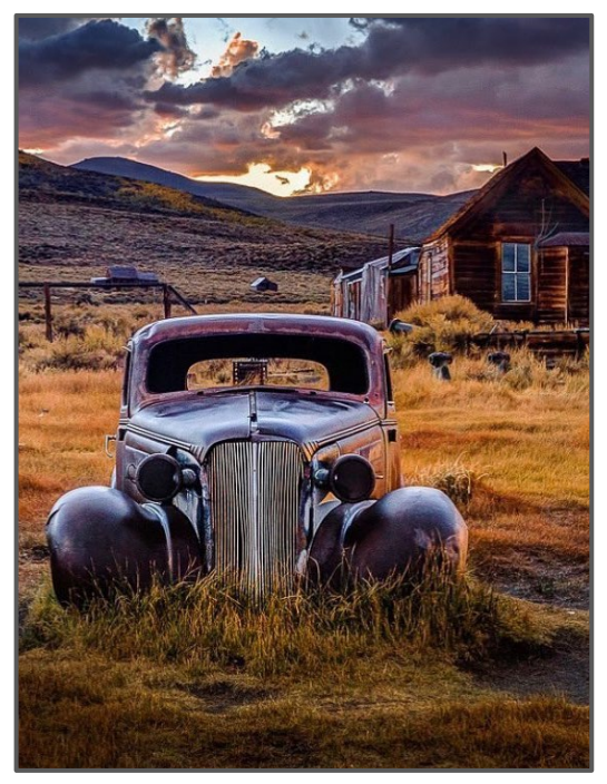
Mono County Tourism/Bodie

The county is home to, and named after, Mono Lake, which is a large high-desert saline lake with intriguing limestone tufa formations and is a vital habitat for millions of migratory and nesting birds. Mono Lake is just one of the reasons that Mono County draws landscape photographers year-round. Another highlight is the historic gold rush town of Bodie, which during its heyday in the late 1800s, was home to as many as 10,000 people, and is now maintained as a State Historic Park with about 200 buildings still standing as they were left, preserved in a state of "arrested decay" for visitors to enjoy. Other natural wonders that attract people to Mono County include Devils Postpile National Monument, one of the world's finest examples of columnar basalt and the headwaters of the Owens and Middle Fork San Joaquin Rivers; two of the state's important most watersheds. Yosemite National Park's eastern entrance at Tioga Pass is only 12 miles from Lee Vining and Mono Lake.