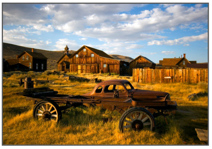
Mono County Tourism/Bodie State Historic Park

with about 200 buildings still standing as they were left, preserved in a state of "arrested decay" for visitors to enjoy. Other natural wonders that attract people to Mono County include Devils Postpile National Monument, one of the world's finest examples of columnar basalt and the headwaters of the Owens and Middle Fork San Joaquin Rivers; two of the state's most important watersheds. Yosemite National Park's eastern entrance at Tioga Pass is only 12 miles from Lee Vining and Mono Lake.