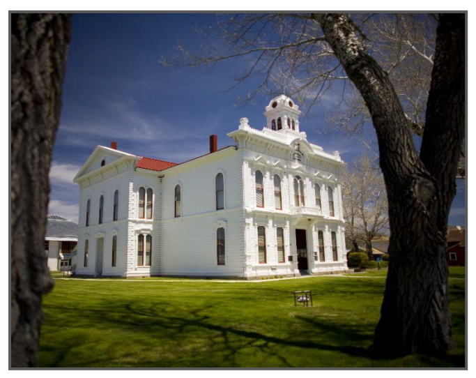
Bridgeport Courthouse

Mono County has several small towns and charming villages, each with its own scenic beauty, year-round recreational opportunities, natural historical and attractions, and unique characteristics. The County seat is proudly located Bridgeport, where the original 1881 courthouse is the second oldest in the state to be in continuous use. The only incorporated town in the county is Mammoth Lakes, which is located at the base world-renowned Mammoth Mountain Ski Area, with a summit of 11,053 feet, over 3500 skiable acres, 28 lifts, and an average of 400 inches of snowfall