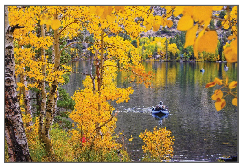
Mono County Tourism/Silver Lake

Summer, however, is when Mono County really shines. The region offers countless miles of alpine hiking, superb trout fishing at dozens of well-stocked lakes, streams and rivers, kayaking,