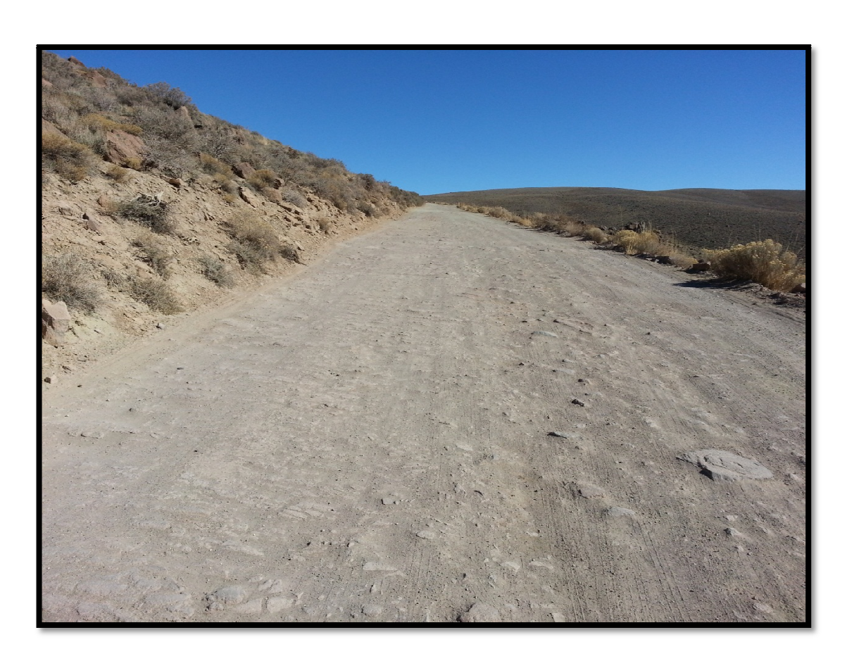
Typical Rough Section