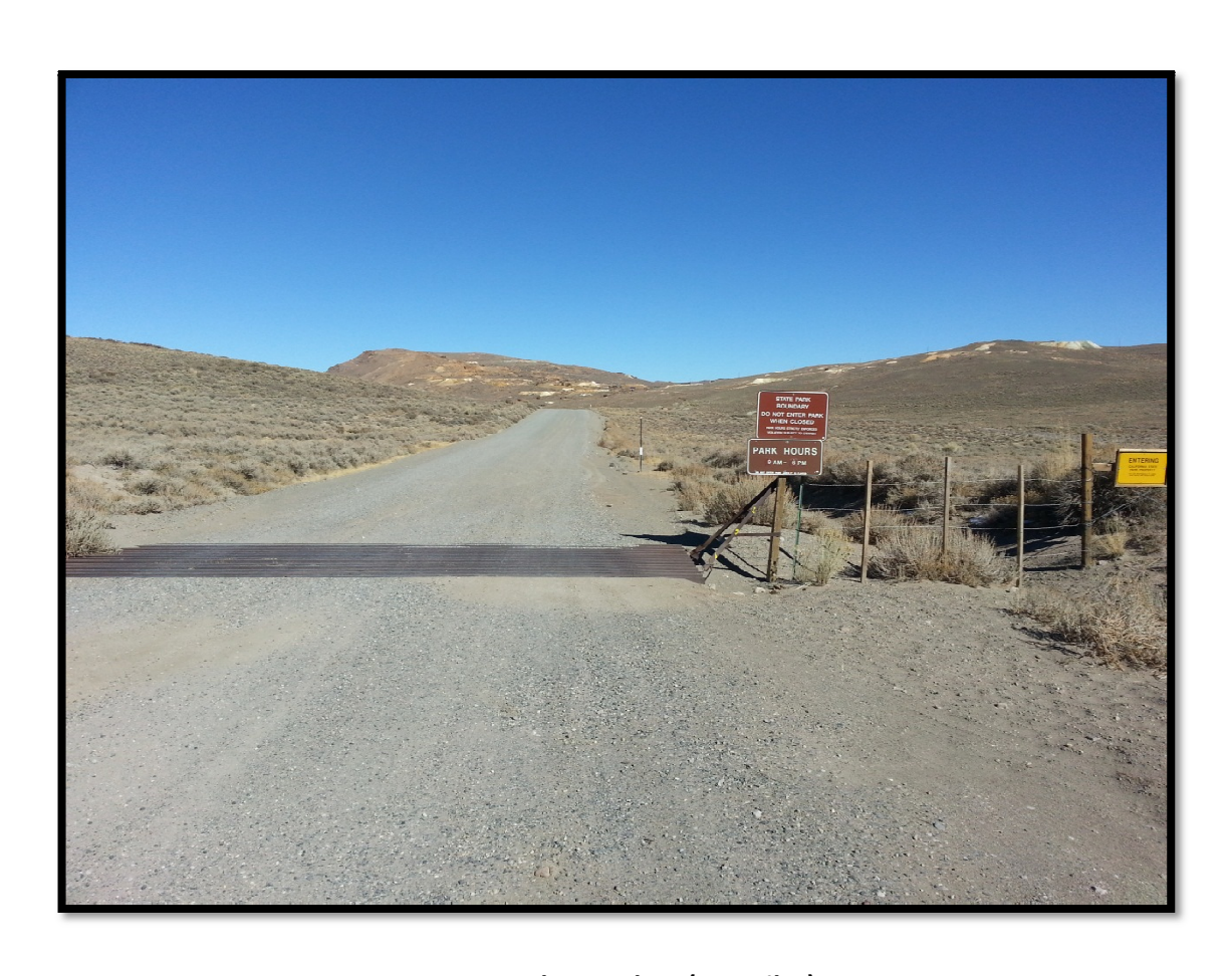
State Park Boundary (2.2 Miles)