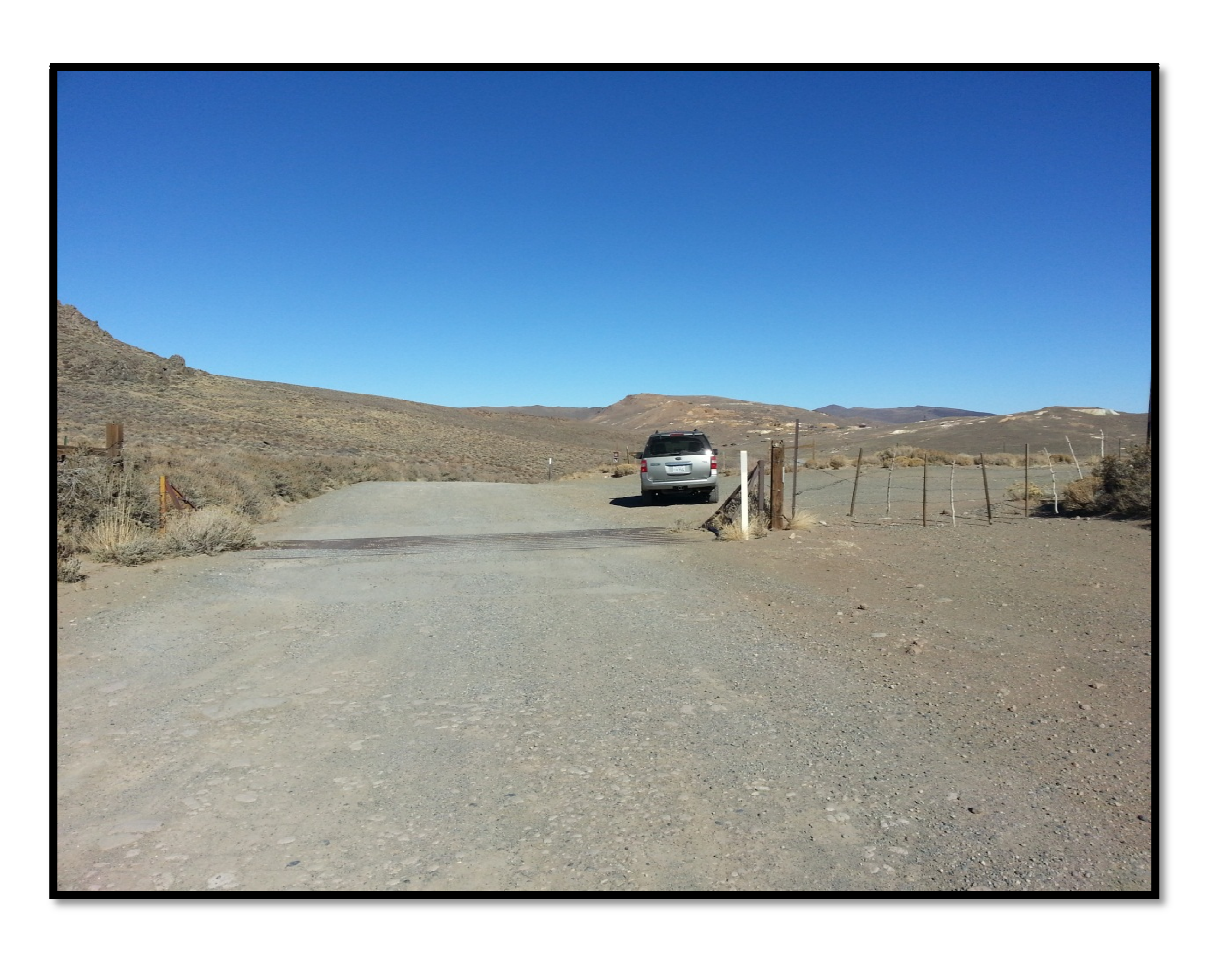
Top of Bodie Bowl (1.7 Miles)