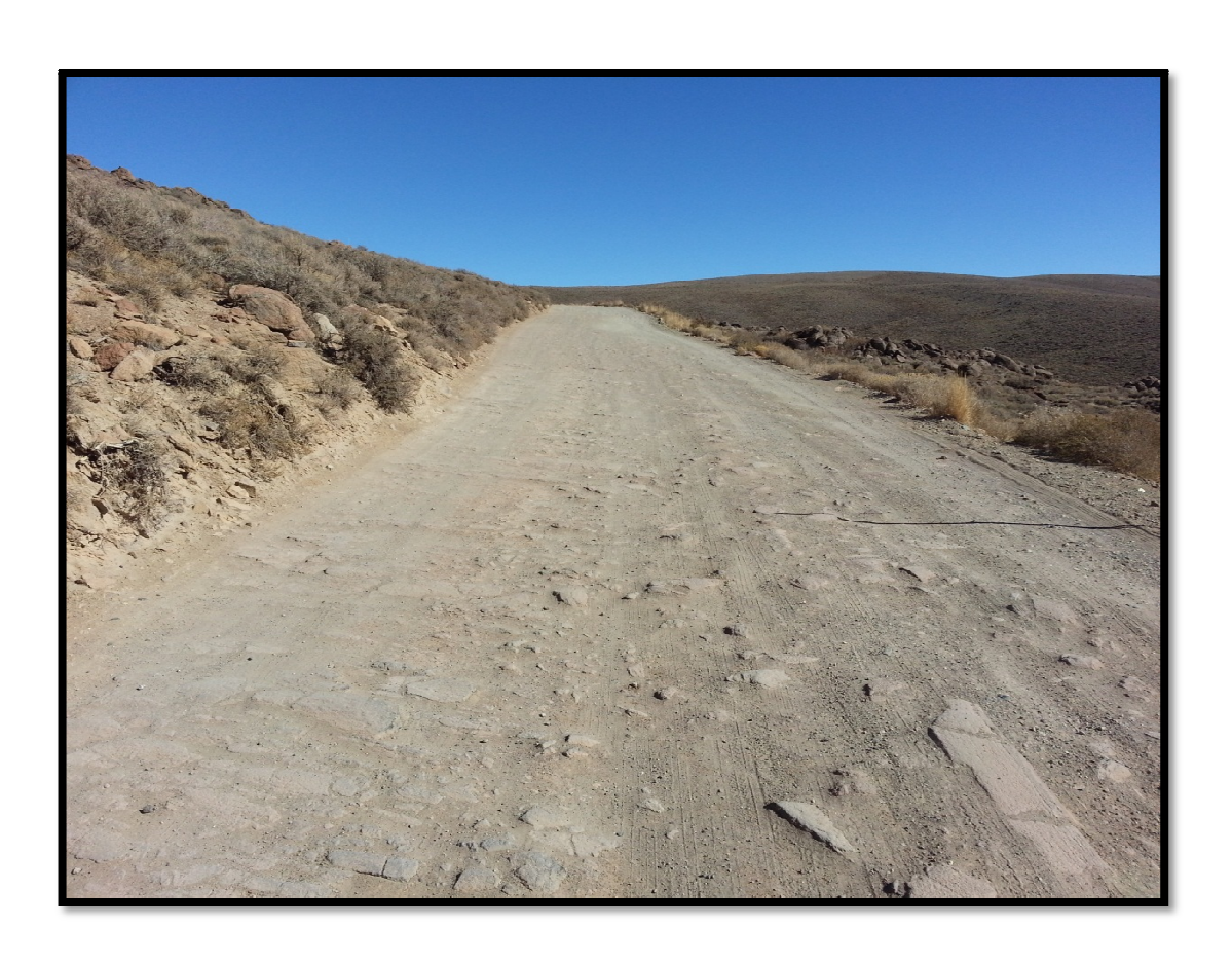
Typical Rough Section