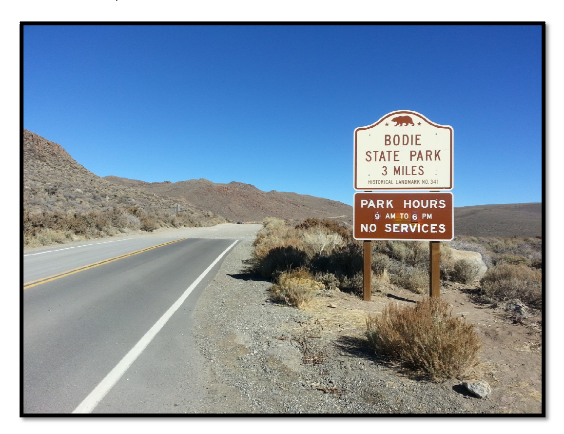
End of Pavement/State Highway 270