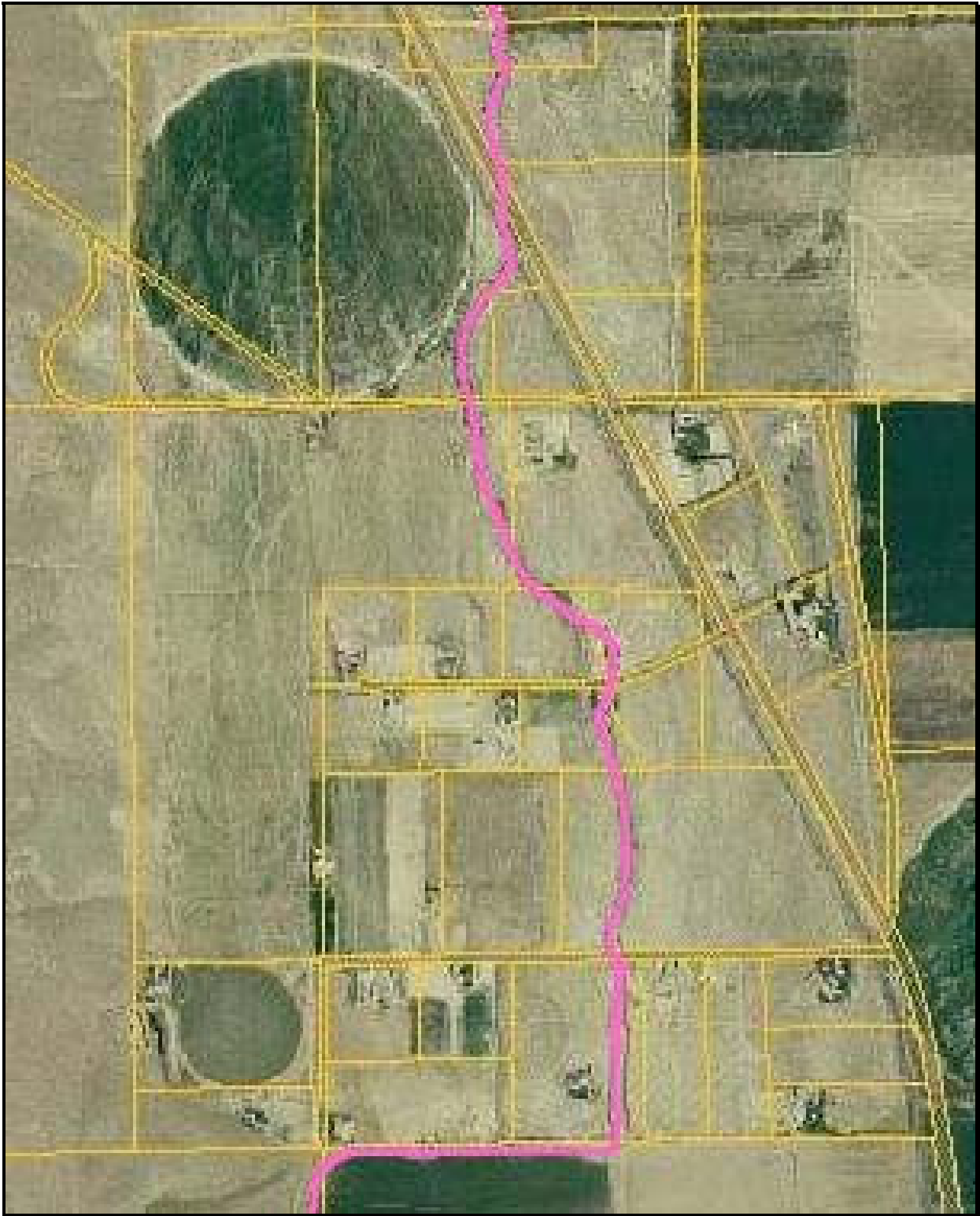
Approximate flood channel alignment near Black Rock Mine Road & Dawson Ranch Road.

Channel Alignment – Hammil Valley Flood Channel Vegetation Removal